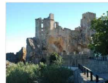
The Most Beautiful White Villages