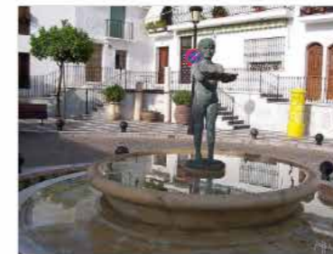
Costa del Sol