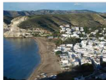
Costa de Almeria

Our specially chosen compilations of destinations from the resorts on the ever popular Costa del Sol, to the more unusual places to visit in the Granada Geopark or Andalucia's impressive list of UNESCO World Heritage Sites.