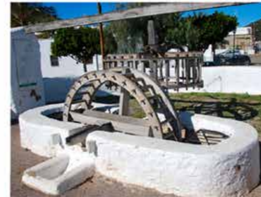
Alfete at Cabo de Gata