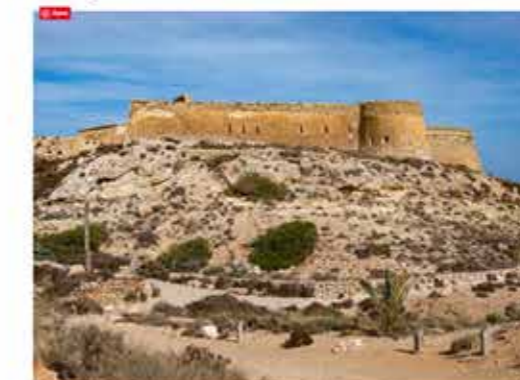
Calderas and beaches

No human ears were assaulted by the noise, nor were any human eyes there to observe the pillar of fire illuminating the ash embroiled landscape for all this happened eight million