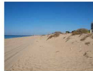
Costa de la Luz